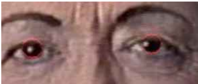
Figure 2. Pupils detection. The pupils as identified by the computer system are depicted as circles around the pupils.

tarily move the face and make facial expressions. The overall facial symmetry and synkinesis can be quantified.