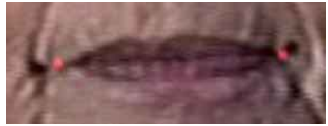
Figure 3. Identification of the corners of the mouth, shown as dots over part of the original image.

In future work, we plan to detect the eyebrows, and to use a calibration procedure to obtain the