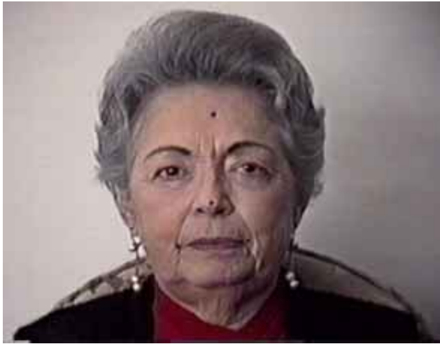
Figure 1. Original image used for the analysis. Some markers (black dots) can be observed, but these were not used by the current image processing system.