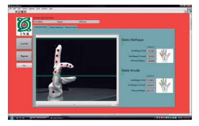
Figure 4. Measurements of the ring and little finger of the mechanical mannequin.

Although, the glove design and the management of the cameras were very difficult, it was possible to control the reflections and unwanted items by mean of white glove with markers size-geometrybased. Measurements of all the joints of the hands can be acquired using three views, simultaneous and automatically. The glove is easy to put on, is no user-depend and has a quick calibration procedure. The lectures were got using no only a mechanical hand mannequin with simulated movements but